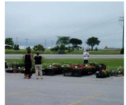
Flowers and plants brighten the market every week!

The current economic conditions have made services such as the Between Friends Food Pantry more important than ever. We accept donations and deliver them to the food pantry.