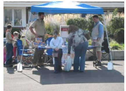
Cub Scout Booth on Community Day 2008

If you know of any organizations that would be interested in joining us that day, please have them call Pat at 630-466-1014