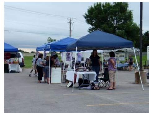
Even a cloudy day couldn't keep our vendors and loyal patrons away!

The current economic conditions have made services such as the Between Friends Food Pantry more important than ever. We accept donations and deliver them to the food pantry.