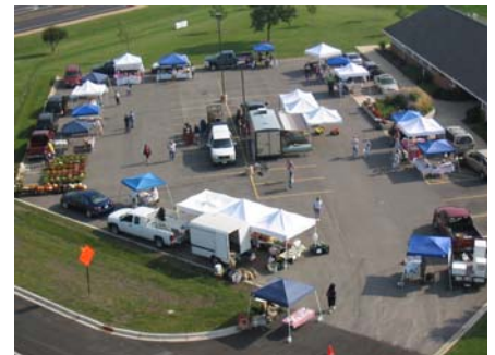
2009 Sugar Grove Farmers Market from the Fire Department's ladder truck.

Tastefully Simple -- Purchase $25.00 of TS product and receive a special gift -a free appetizer book.