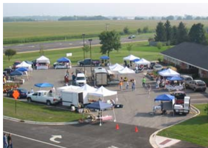
Aerial view of Sept. 12, 2009 Sugar Grove Farmers Market

Non-profit groups such as Scouts, PTO's, etc. are invited to have a booth at this market, with prior notice. Call the Chamber at 630-466-7895 for info and reservations.